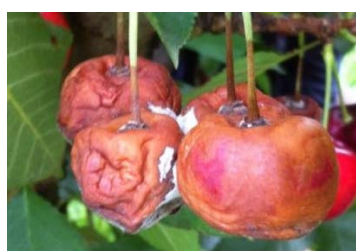
Left: typical symptoms of fruit infected with Botrytis