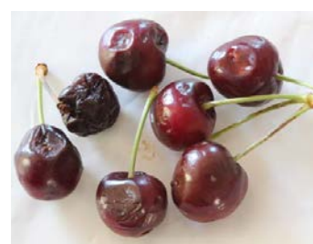
Right: typical symptoms of fruit infected with Alternaria